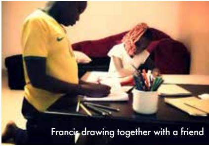
Francis drawing together with a friend