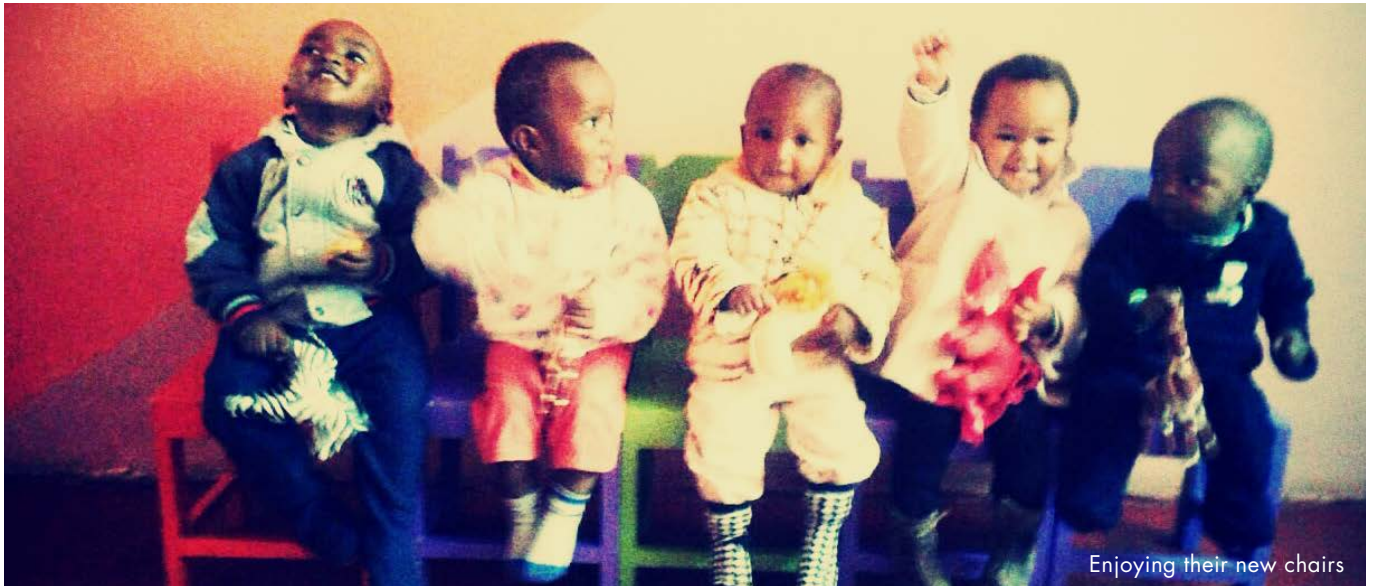
Enjoying their new chairs