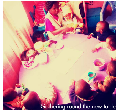
Gathering round the new table

Many thanks to our generous 'Givers of Hope' for making this support possible!