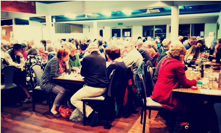
A full house of Trivia participants